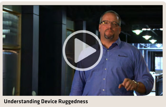
Understanding Device Ruggedness

Because downtime is so expensive, there is clear value to keeping these devices functional. Ruggedness is a requirement, not an option, when working extensively outside office and home environments. In the real world, mobile phones will be dropped onto concrete, and they will be rained on. That doesn't mean the phone will stop working. There are product features that protect phones – and preserve productivity – in very challenging environments. The following sections explain how specific features and product characteristics impact reliability in non-office environments.