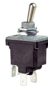
2NT91-2 2 Pole, 2 Position