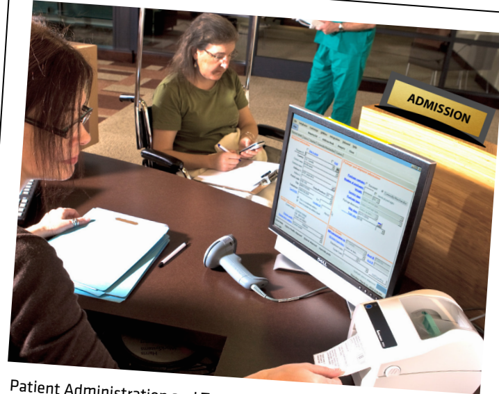
Patient Administration and Tracking >>

Partner customizable area: Solution, offer, and links to site