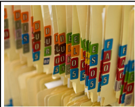
Security & Records >>