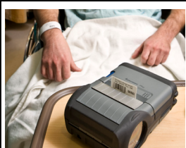
Point of Care >>