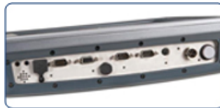
Docking system and UPS